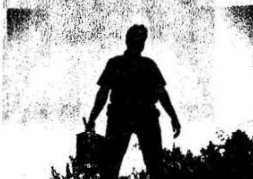
boyfunk agent "x" sets out on Project: Sparkler.

I'm so fuckin' sick of gay men who act like who they fuck or wanna fuck is the single most important facet of their existence -- the guys whose synapses fire only in thinking about who, when, how and where they're