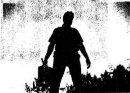
boyfunk agent "x" sets out on Project: Sparkler.

I'm so fuckin' sick of gay men who act like who they fuck or wanna fuck is the single most important facet of their existence -- the guys whose synapses fire only in thinking about who, when, how and where they're gonna bone the next twink they have their eye on.